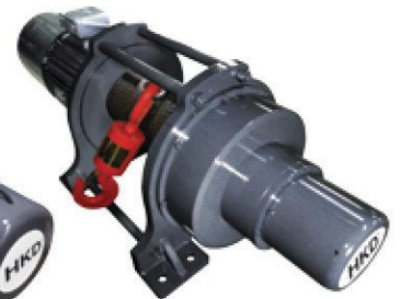
HKD-213 | HKD-214 | HKD-215